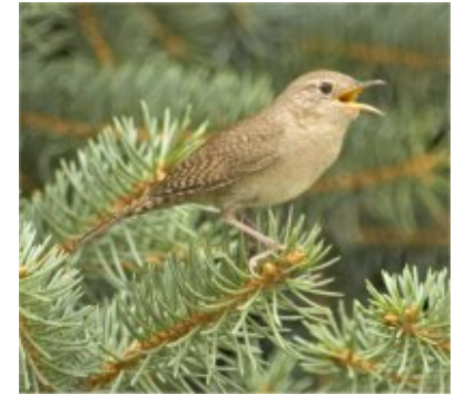
Singing House Wren

Its better if a perch is not used. Perches make it easier for predators like cats and squirrels to reach inside.